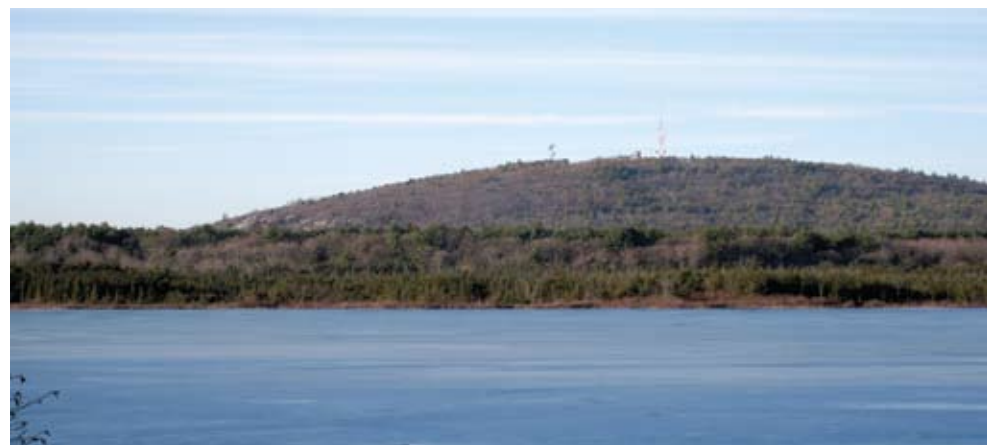
Ponkapaog Pond and Great Blue Hill

Putnam stood to respond. "Commissioner Volpe's plan, he stated, represents nothing less than the wanton and reckless sabotage of the public domain. We must preserve the Reservation. Boston is the second most congested metropol-